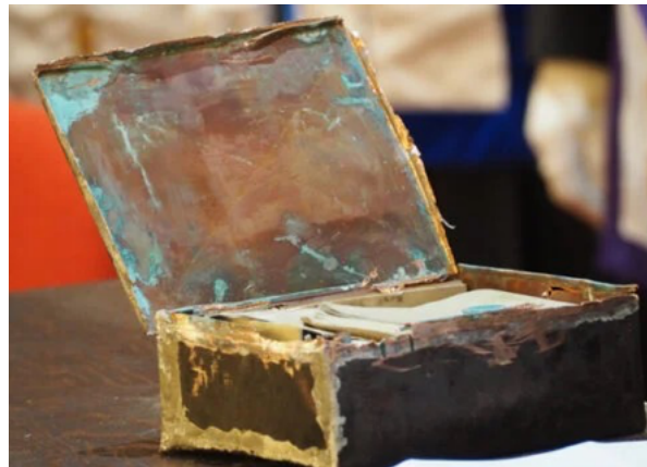
Benn's Church Time Capsule

One hundred years ago on July 4, a mason laid the cornerstone at Benn's United Methodist Church, concealing a copper box within it. The box sat soldered shut and undisturbed for the next century until opened on July 7 of this year during a Sunday service celebrating the building's centennial anniversary.