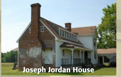
Joseph Jordan House