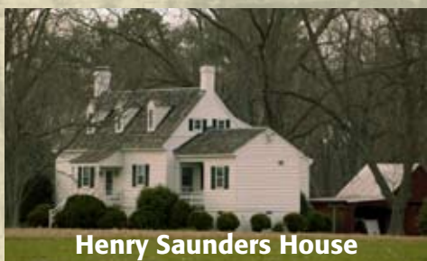
Henry Saunders House