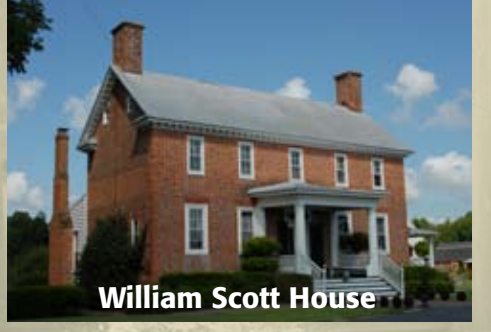
William Scott House