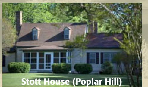
Stott House (Poplar Hill)